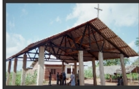
One of four pole churches built to house worship in the bush.

They meet under tin roofs in stick-and-mud structures or in "pole churches" built by locals and visiting teams, under trees with their cattle nearby, or even in existing churches and schools. Usually, a trained evangelist leads the worship and shares God's Word. When their ordained pastor comes, they celebrate Holy Communion and baptize new members—from children to village elders.