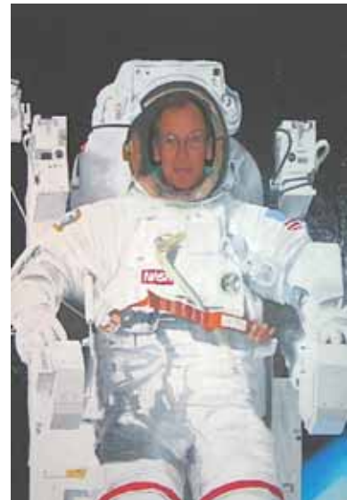
Beam me up, Scottie.