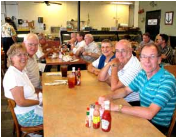
Good Lutherans like to eat. Trinity Ministries outing.

If your birthday does not appear, please contact the church office at 743-5741 so we may update our records.